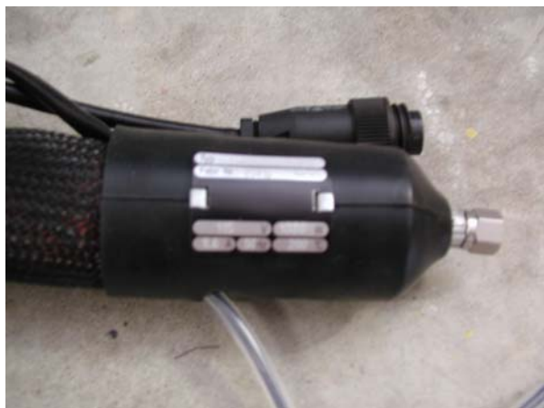
Figure 2: Heated Sample Line

The sample line is constructed of a 316 SS corrugated tube with constant power density heating elements and thermocouple temperature indication. Closed cell silicone foam is used to insulate the heated core and then covered with a poly-propylene jacket. Two, 1/4" O.D PFA Teflon tubes are installed within the heated core. The sample tubes are removable and replaceable. The configuration is capable of maintaining 200°C sample gas temperature in 0°C ambient temperature. The length of the heated sample line supplied is 50 feet. The minimum bend radius of the tubing bundle is 18 inches.