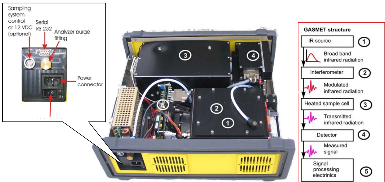
Figure 4: Gasmet DX-4000

An Ultra pure Nitrogen (N2 99.99%) gas cylinder is required for proper zeroing (baseline) of the FTIR analyzer. Nitrogen and calibration gases are to be supplied by the customer.