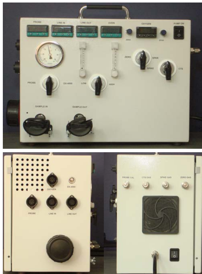
Figure 3: PSU Sample Interface

Three way pneumatic valves are provided for introducing zero and span gases into the system. These gases can be directed either to the sample probe or directly to the gas analyzer using either the low or high flow meters.