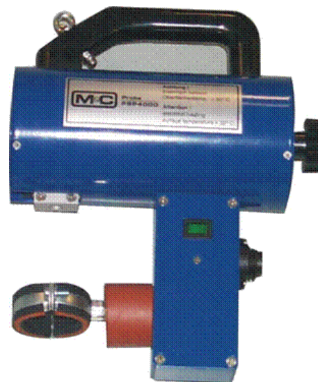
Figure 1: Sample Probe

The heated sample line temperature is maintained up to 200° C by a digital temperature controller. A "K" type thermocouple is embedded in the power end of the heated sample line, approximately ten feet from the end, and connected to the controller for temperature indication. The 110 VAC 10 Amp current flows through a solid state relay. The temperature controller and relay are located in the PSU Sample Interface and connect to the heated line